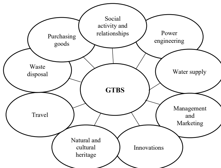
Fig. 2. Key tourism sectors assessed by the UK Green Tourism Business Scheme

Today, the Green Start Programme has over 850 members in the UK, making it the largest and most respected sustainability certification programme in the world, offering a reliable, credible, independent assessment of tourism businesses wishing to operate under a sustainable development scheme [4].